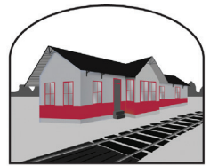
Town of Hampstead