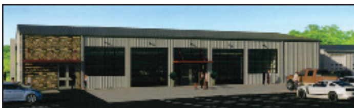
New Event Center

Hampstead Volunteer Fire Department 410-239-4280 Learn more at: www.hampsteadvfd.org