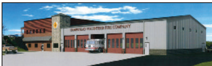
New Emergency Operations Building